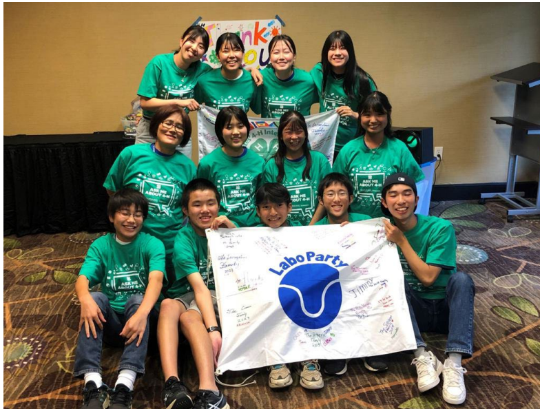
LABO Michigan Delegation 2023

Thank you very much to all our families who annually open their homes to create 4-H international experiences across the globe.